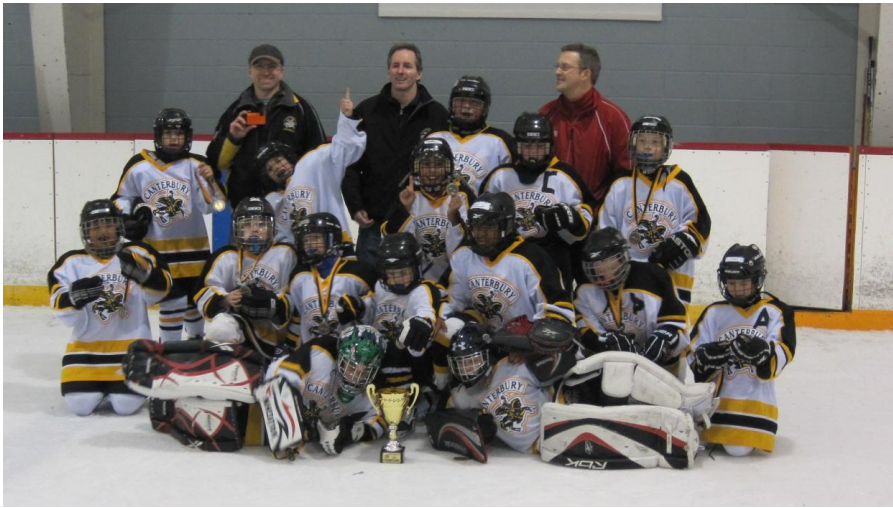
Congratulate our Atom B1 Ice Warriors for winning The Vankleek Hill Tournament on November 27, 2011!!