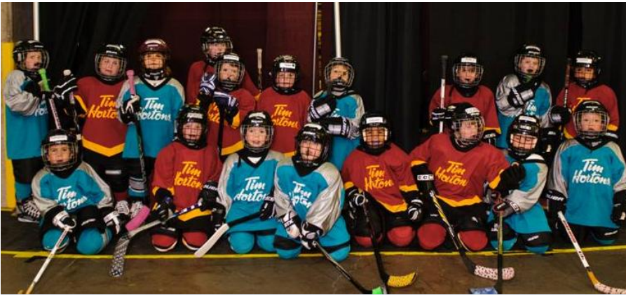
Roster (left to right)