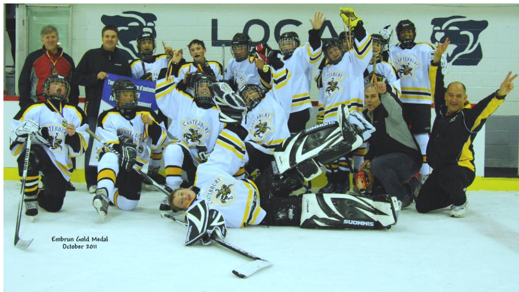
Embrun Gold Medal October 2011