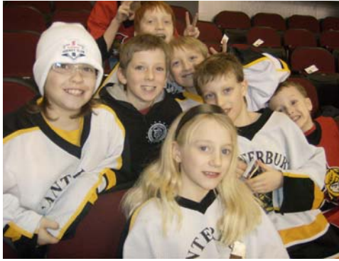
Players and friends of Atom C Lightning