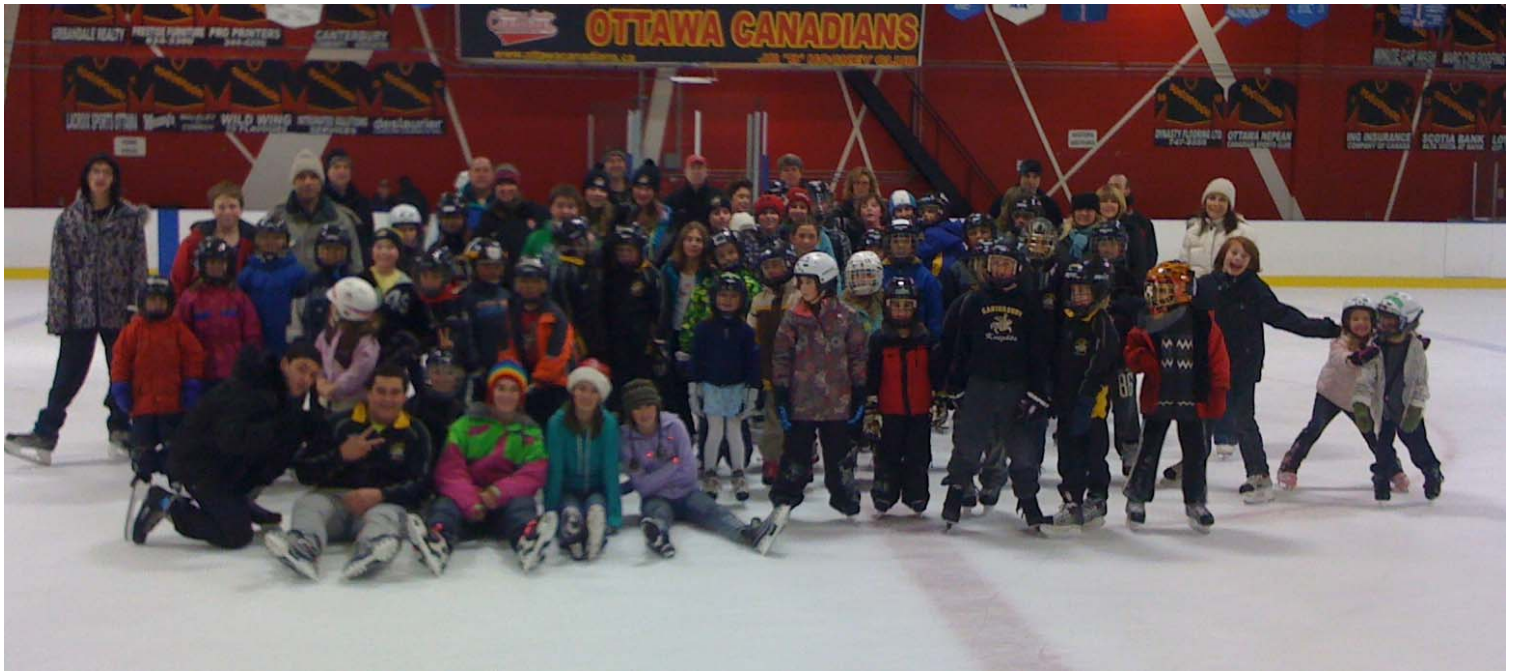
This year's family skate was held December 20, 2010 from 6:00 to 7:50, Kilrea Arena followed by the coach's games. As you can see, everyone had a great time.