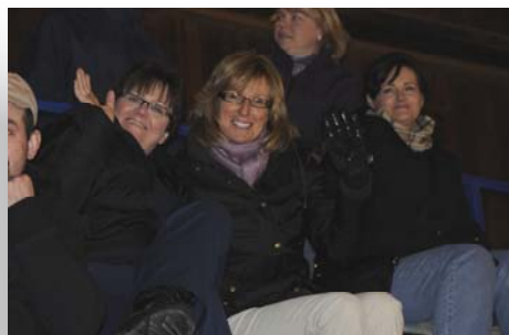
Some hockey moms enjoying the skills competition at the 37 th Annual, Hubert Seguin Bantam Cougar Cup January 6-9, 2011.

Either way, new friendships were forged, whether the kids ever meet face-to-face.